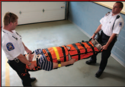
Reeves Sleeve 122

Reeves Spine Board — A spine board that can be inserted into the Reeves Sleeve to immobilize patients with spinal or neck injuries.