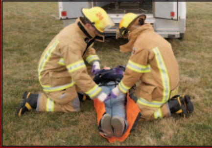
104 Mass Casualty Stretcher

RSS0008 (Orange); RSS0011 (Gray); RSS0064 (Black)