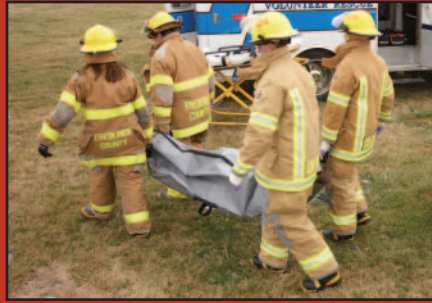
105 Stretcher w/ Sealed Body Cover**