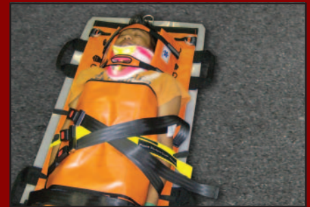
Reeves Sleeve Dragable

Head Blocks, Transport Bag, Head and Chin Strap Set, Buckles