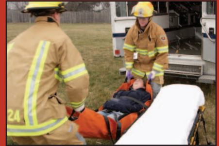
103 Heavy Duty Stretcher