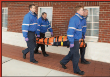
Reeves Sleeve II

Head Blocks, Transport Bag, Head and Chin Strap Set, Buckles