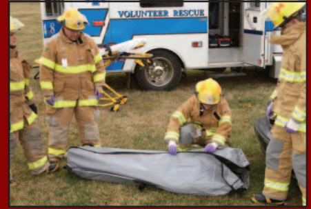
106 Heavy Duty Stretcher w/ Sealed Body Cover**