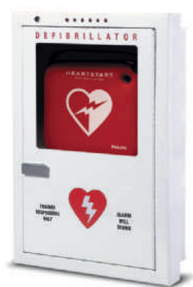
Premium Semi-recessed Cabinet Item # PFE7023D

Dimensions: 16" (41 cm) w, 22.5" (57 cm) h, 6" (15 cm) d