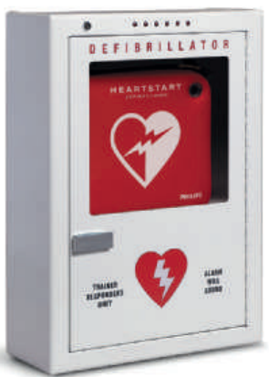
Premium Surface Mounted Cabinet Item # PFE7024D

Dimensions: 16.5" (42 cm) w, 15" (38 cm) h, 6" (15 cm) d