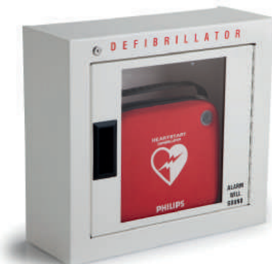
Basic Surface Mounted Cabinet Item # 989803136531

To help mobilize an emergency medical response or deter AED theft, Philips offers three different battery-operated, alarmed wall cabinets. The basic cabinet has a simple audible alarm. Also available are two premium cabinets: a wall surface mounted cabinet and a semi-recessed cabinet that is inserted into a wall cut-out for a less obtrusive look.* The premium cabinets feature combination audible and flashing light alarms. They are made of sturdy heavy-gauge steel, and are large enough to accommodate additional medical supplies, such as oxygen. You can also connect the premium cabinets' alarms to your internal security system so that a more coordinated emergency response can be mobilized centrally.