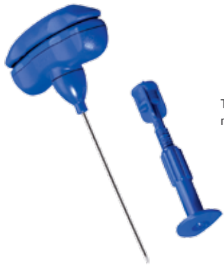
T-handle Illinois needle with removable depth stop