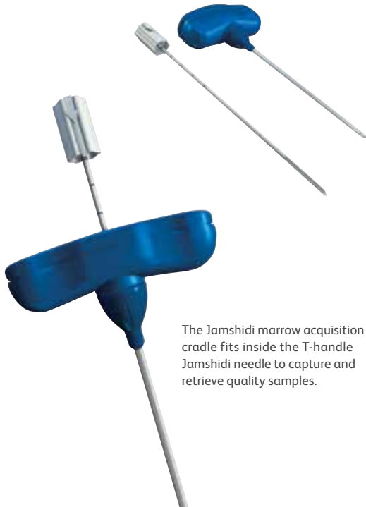
The Jamshidi marrow acquisition cradle fits inside the T-handle Jamshidi needle to capture and retrieve quality samples.