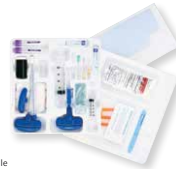
Safe-T PLUS tray with T-handle Jamshidi needle