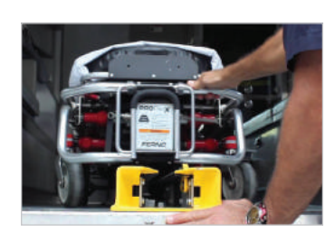
SAE J3027 compliant when combined with the Stat Trac® Cot Fastening System