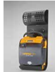
Wall Mount Bracket for LIFEPAK CR Plus AED