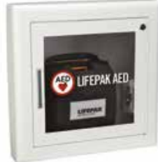
Semi-Recessed (3" Return)