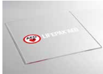
AED Cabinet Window Replacement Kit