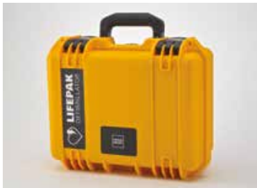
Hard-shell, Water-tight Carrying Case