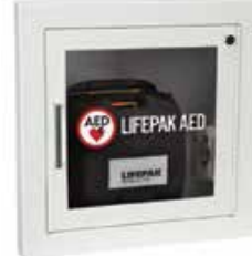
Recessed Mount (1.5" Return)