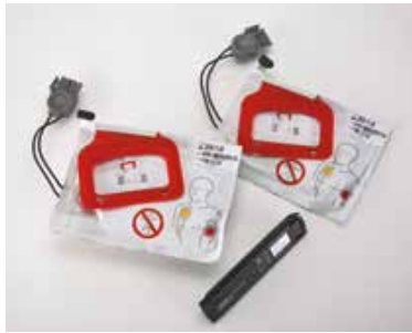
Replacement Kit for CHARGE-PAK™ Battery Charger

Includes 2 sets electrodes and 1 battery charger, replacement instructions, and discharger for safe disposal of used CHARGE-PAK charger