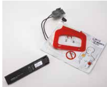
Replacement Kit for CHARGE-PAK Battery Charger

Includes 1 set electrodes and 1 battery charger, replacement instructions, and discharger for safe disposal of used CHARGE-PAK charger.