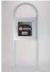
AED Floor Stand Cabinet with Alarm