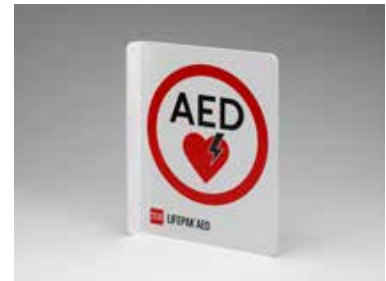
AED Location Sign T-mount, traditional w/logo, 8" x 10" 11998-000331 T-mount, traditional w/o logo, 8" x 10" 11998-000333