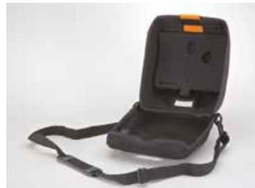
Complete Soft Shell Carrying Case