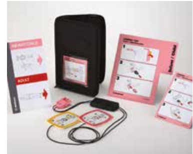
Infant/Child Reduced Energy Defibrillation Electrode Starter Kit

For use only with LIFEPAK ® 500 Biphasic AED with pink connector or LIFEPAK 1000 defibrillator, LIFEPAK EXPRESS AED or LIFEPAK CR Plus AED. For use on children less than 8 years of age or less than 55 lbs.