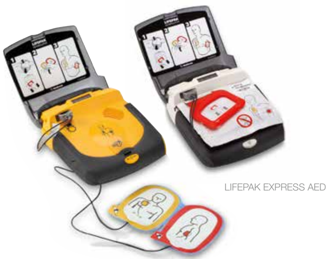
LIFEPAK CR PLUS AED

Ensure the safety of your staff and patients. Only Physio-Control accessories and disposables have been thoroughly tested with LIFEPAK products. Stick with the name you trust and the company that stands behind it. To order, contact your Physio-Control representative or order 24/7 at store.physio-control.com .