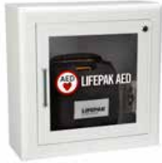
Surface Mount (7" Return)