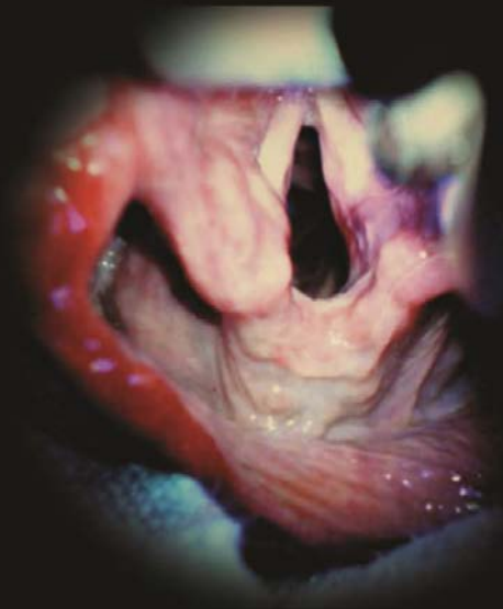
IntuBrite Ultraviolet/White LED