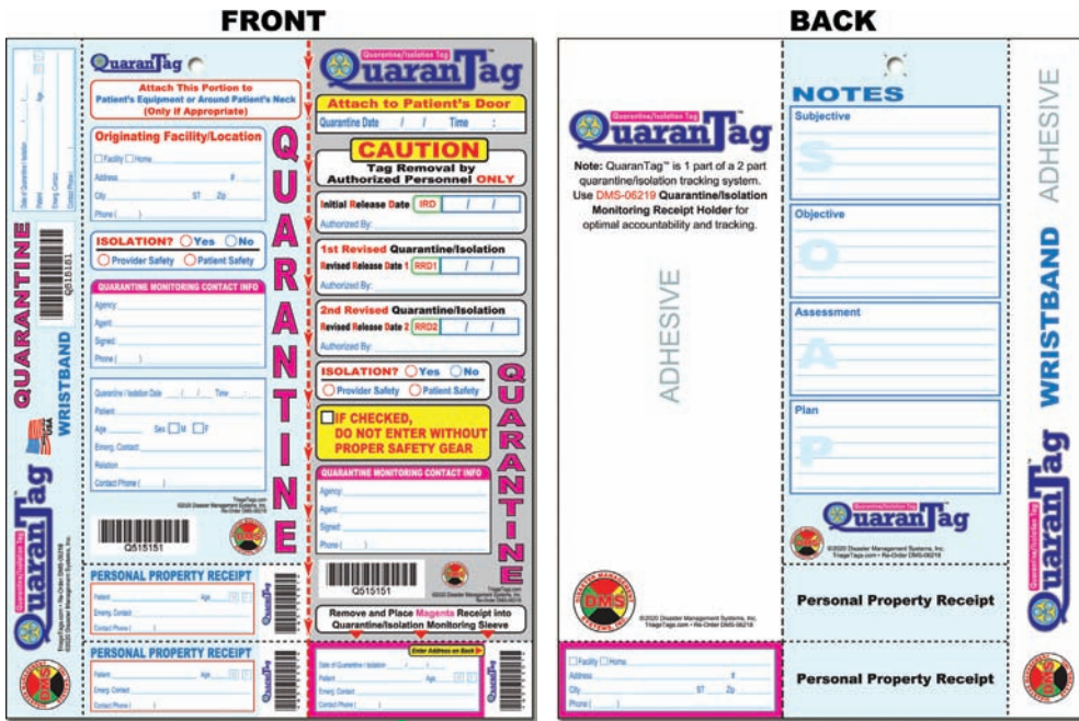
QuaranTag™ Quarantine Monitoring Receipt Holder

via a tag that can either be attached to the patient via the string, wristband, or applying directly to the patient's equipment. This system also allows you to link the patient to their personal property plus monitor and track their release status.