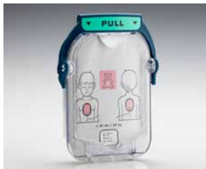
Infant/Child SMART Pads Cartridge Item # M5072A

HeartStart Adult SMART Pads are appropriate for cardiac arrest victims weighing 55 pounds (25 kg) or more.