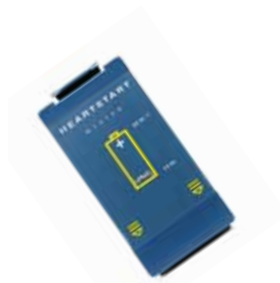
Long-life Battery Item # M5070A

Dimensions: 9.5" (24 cm) w, 5.5" (14 cm) h