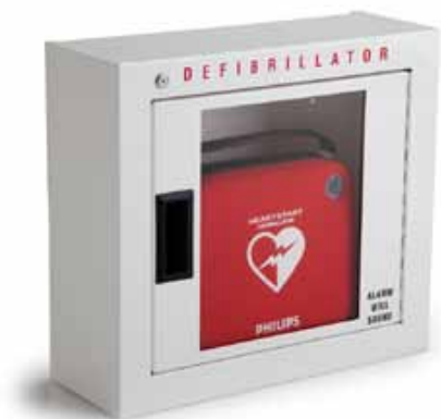
Basic Surface Mounted Cabinet

To help mobilize an emergency medical response or deter AED theft, Philips offers three different battery-operated, alarmed wall cabinets. The basic cabinet has a simple audible alarm. Also available are two premium cabinets: a wall surface mounted cabinet and a semi-recessed cabinet that is inserted into a wall cut-out for a less obtrusive look.* The premium cabinets feature combination audible and flashing light alarms. They are made of sturdy heavy-gauge steel, and are large enough to accommodate additional medical supplies, such as oxygen. You can also connect the premium cabinets' alarms to your internal security system so that a more coordinated emergency response can be mobilized centrally.