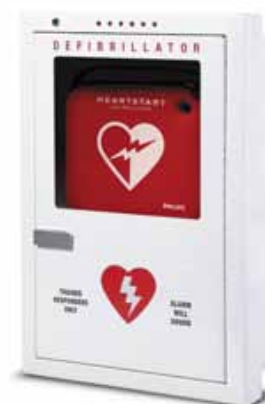
Premium Semi-recessed Cabinet

16" (41 cm) w, 22.5" (57 cm) h, 6" (15 cm) d