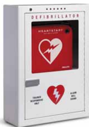
Premium Surface Mounted Cabinet

16.5" (42 cm) w, 15" (38 cm) h, 6" (15 cm) d