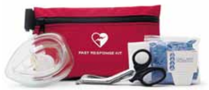
Fast Response Kit Item # 68-PCHAT

The Quick Reference Guide provides a brief overview of defibrillator operation. Its short captions and straightforward drawings break down each step of the defibrillation process.