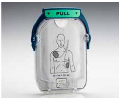
Adult SMART Pads Cartridge Item # M5071A

HeartStart Adult SMART Pads are appropriate for cardiac arrest victims weighing 55 pounds (25 kg) or more.