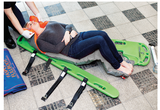
Can Be Easily Separated At Either End