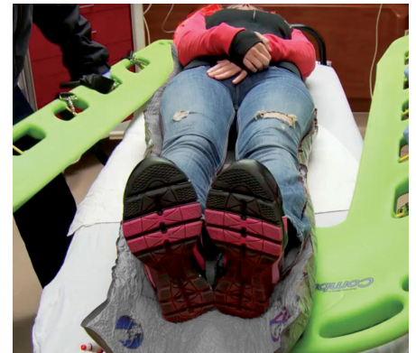
Safely extricate and transfer a patient to the cot. The CombiCarrierII is easily removed eliminating the loss of your valuable equipment.

The innovative design of the CombiCarrierII provides emergency medical and rescue personnel with two products in one, saving valuable storage space, weight and critical budget dollars. Comes with an industry leading 5-year warranty.