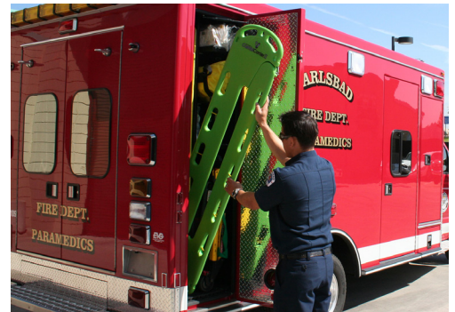
Fits In A Standard Backboard Compartment