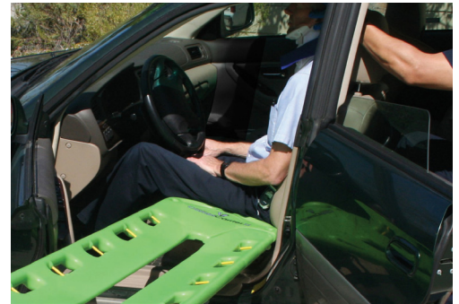
Tapered Ends To Simplify Extrication