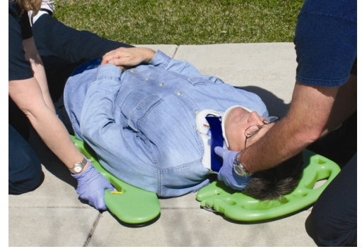
Functions Like A Scoop Stretcher