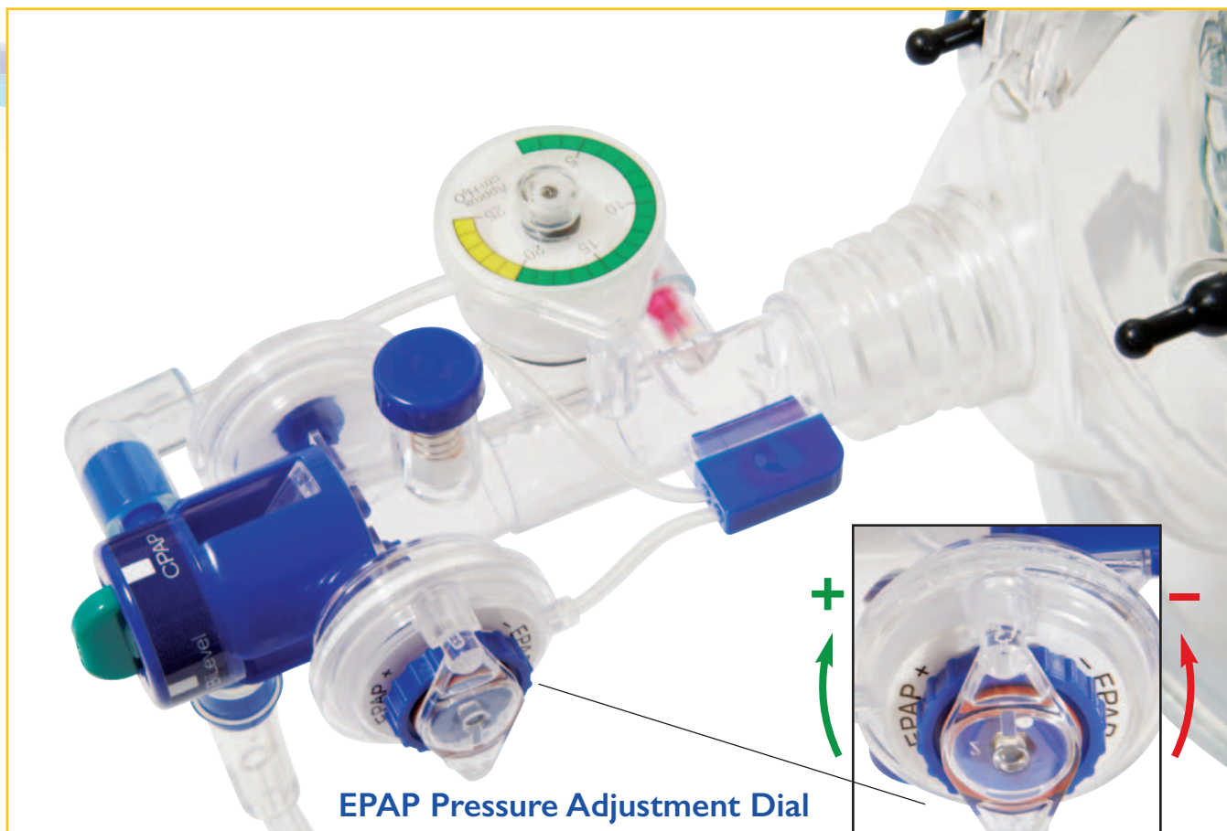
EPAP Pressure Adjustment Dial