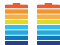
2 "C-Cell" batteries included in handle to boost LED output