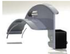
Strong Stainless Steel reinforcement in the base making it stronger than all plastic base laryngoscopes plastic jacket