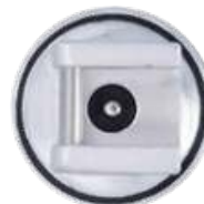
Handles feature all metal heads.