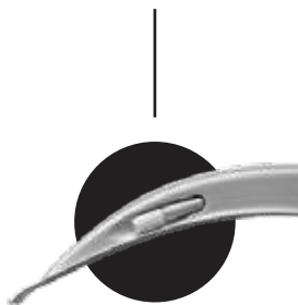
Brightest LED laryngoscope in the market