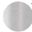
Textured metal handles for maximum control and handling