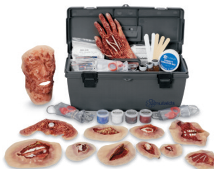
620 Xtreme Moulage Kit