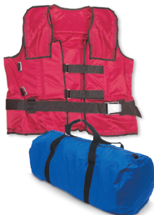
1118 Weighted Vest and 2094 Carry Bag