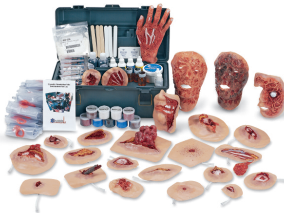
028 Xtreme Moulage Kit