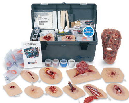
025 Xtreme Moulage Kit